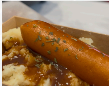
Bangers & Mash

Add $1.50 per portion for Mentaiko Sauce