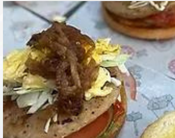
Gourmet Chicken Burger

$700 for 100 portions Additional $6 per portion Add $1 per portion for Fries