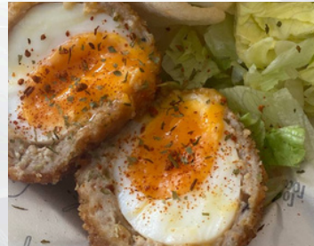
Chicken Scotch Egg with Prawn Crackers & Hoisin Sauce

$550 for 120 portions (2 pieces each) Additional $2.50 per portion