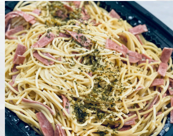
Carbonara with Chicken Ham

$750 for 100 portions Additional $7 per portion