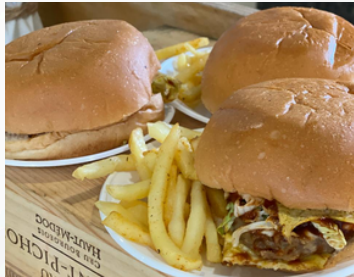
Chicken Ramly Burger

$700 for 100 portions Additional $6 per portion Add $1 per portion for Fries