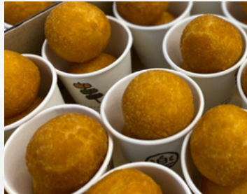
Sweet Potato Balls

$650 for 100 portions Additional $6 per portion