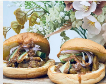
Chicken Satay Burger

$850 for 100 portions Additional $8 per portion Add $1 per portion for Fries